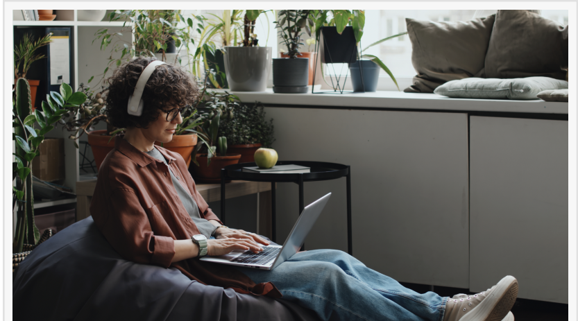
Gen Z person using electronic device

EINPresswire.com/ -- REMIXED, a full-service branding and integrated marketing agency, today unveiled its latest thought leadership article, "Creating Engaging Content for Gen-Z Audiences." This piece dives into the evolving landscape of communication strategies, offering brands actionable insights into authentically connecting with one of the most influential and socially-conscious demographics: Generation Z.