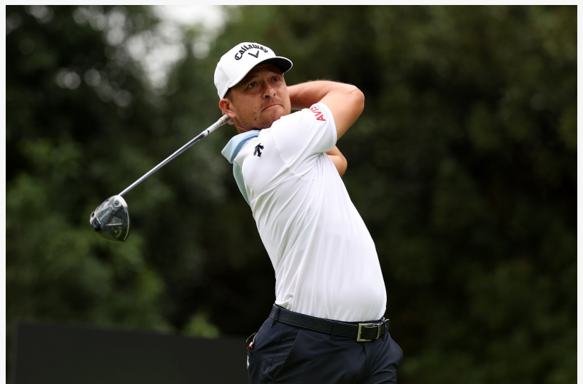
No. 2-ranked Xander Schauffele