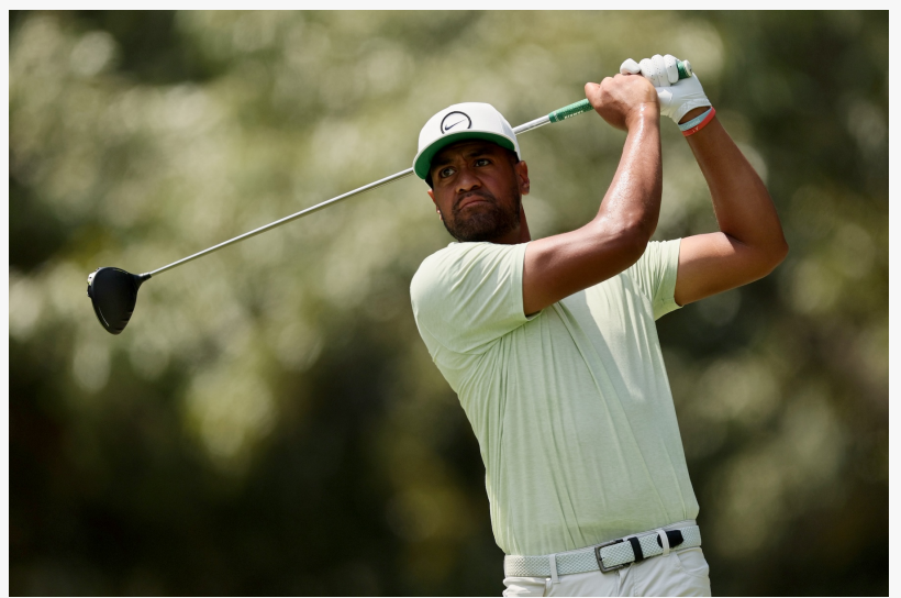
Tony Finau, No. 26th player in the world

Pete Dye Stadium Course (host course) and Nicklaus Tournament Course, as well as La Quinta Country Club, the tournament showcases exceptional talent while supporting local charities through various initiatives. Since its inception, the event has generated over $66 million in charitable contributions. Past champions include inaugural winner Arnold Palmer, Jon Rahm, Phil Mickelson, Mike Weir, Fred Couples, and the 2024 champion Nick Dunlap — the first amateur to win the event and the first amateur to win on the PGA TOUR since 1991. Follow The American Express® on Facebook ( www.facebook.com/theamexgolf ), X (@TheAmexGolf), and Instagram (@TheAmexGolf). Visit www.theamexgolf.com for more information.