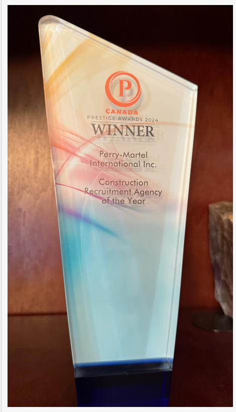
2024 Construction Agency of the Year

About Perry-Martel International Perry-Martel International has been at the forefront of executive recruitment for over 40 years, specializing in C-suite placements across construction, real estate, and technology. Known for their strategic focus and unmatched global experience, Perry-Martel continues to deliver leadership talent