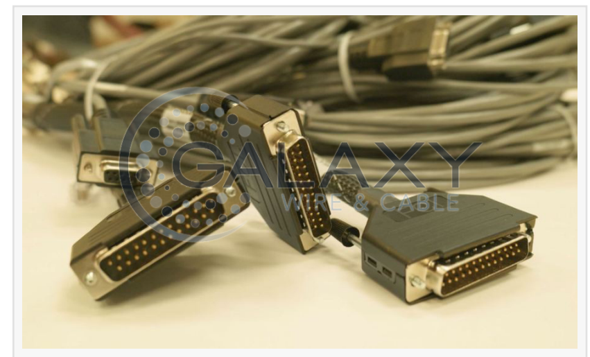
Black overmolded cable assemblies

About Galaxy Wire & Cable, Inc. Galaxy Wire & Cable is a leading supplier and manufacturer of custom and stock wire and cable, in a variety of insulation and jacket materials, with many conductor, shielding and enhancement options, with design and engineering assistance available. Offerings include cable assemblies, wire harnesses, box builds, coaxial/RF jumpers and wire leads. Cable and wire from Galaxy is used for in a variety of industries and applications. Galaxy is a certified woman-owned business/women's business enterprise (WBENC), ISO 9001:2015 certified, ITAR registered, and DBE certified in many