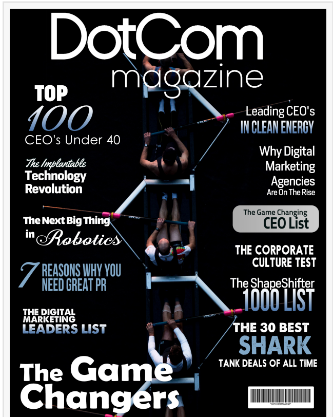
The DotCom Magazine Game Changers Edition