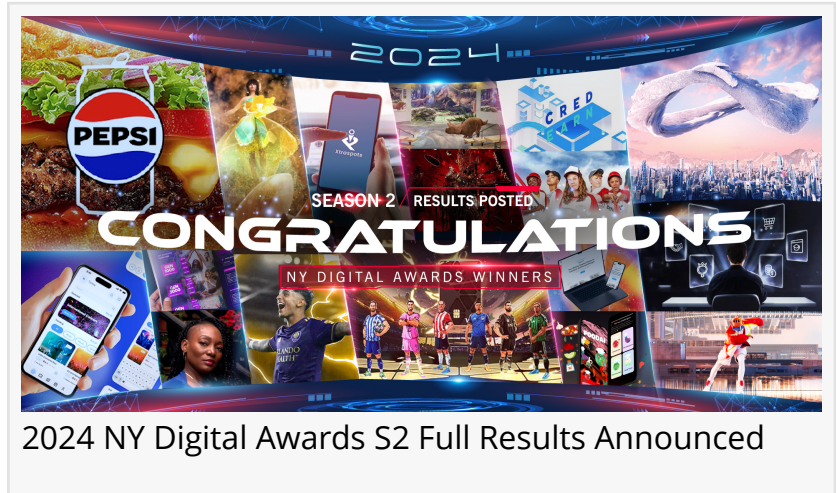
2024 NY Digital Awards S2 Full Results Announced

EINPresswire.com/ -- The 2024 NY Digital Awards : Season 2 has concluded, unveiling its list of winners from around the world. Organized by the International Awards Associate (IAA), the award program celebrates excellence in digital creativity, recognizing outstanding achievements and creative brilliance both locally and internationally.