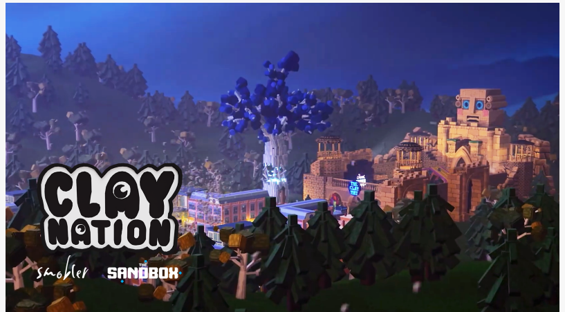
Best Branded Experience of 2024: Saving ClayBox: The Sonic Sands Adventure