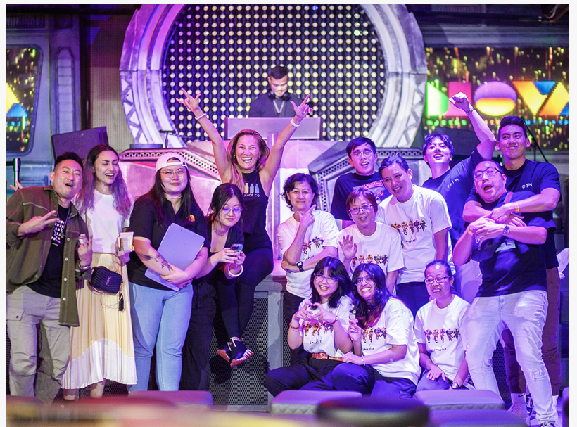
NOVA 2024: Singapore Edition