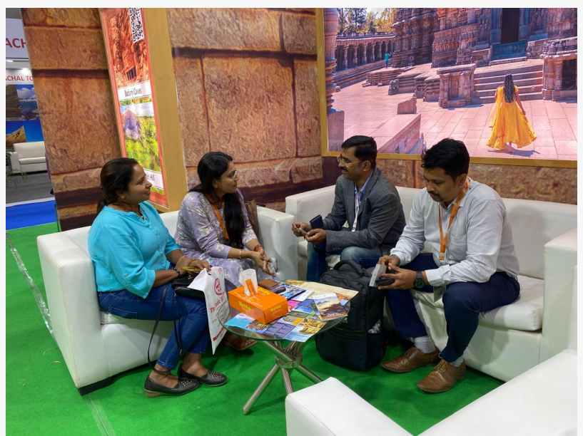
B2B Meetings held between the Travel Trade at the Exhibition

Looking Ahead, participation in IITM Pune 2024 reaffirmed Karnataka's position as a premier travel destination in India. With positive visitor feedback and promising business leads, Karnataka Tourism is set to build on this success, enhancing its offerings and strengthening its global tourism footprint.