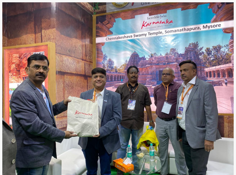
Felicitation of the Dignitaries at the Karnataka Stall at IITM Pune