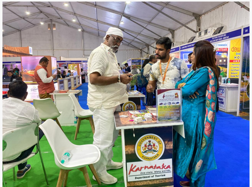
B2B Interactions at the Karnataka Stall