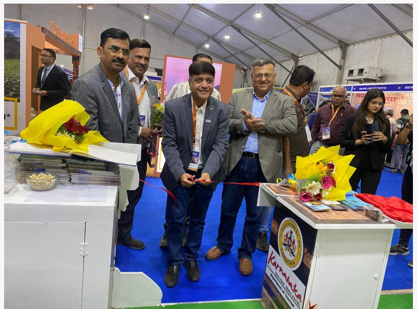
Inauguration of the Karnataka Stall at IITM Pune 2024

The Karnataka Tourism pavilion stood out with its captivating exhibits that highlighted the state's iconic destinations such as Hampi, Mysore, Coorg, Kabini, and Gokarna. Visitors were immersed in Karnataka's unique offerings through captivating displays and eagerly waiting stakeholders who provided first-hand information on the various tourism offerings of the state.