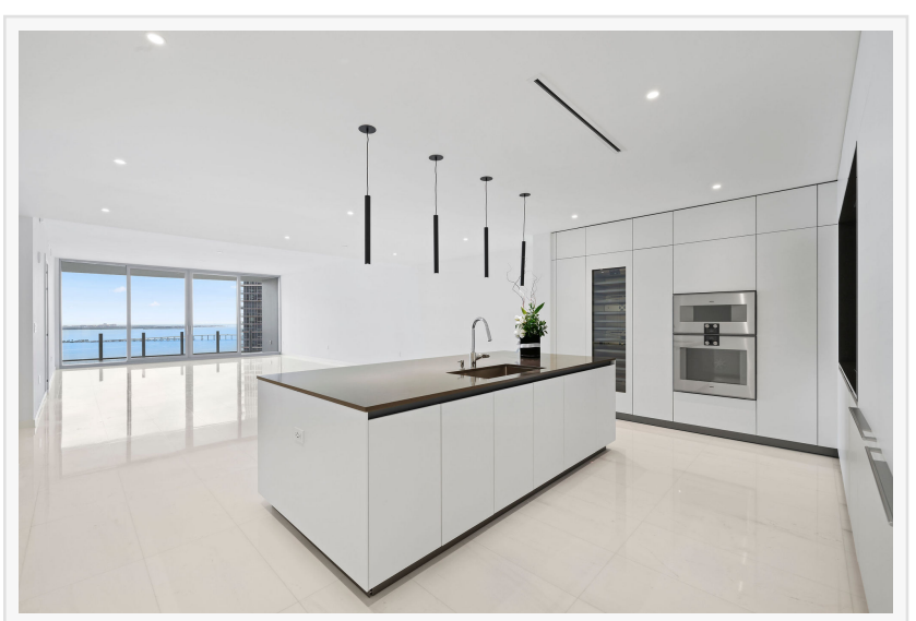
Aston Martin Residences Miami Kitchen, Residence 04

Nestled within one of Miami's most iconic waterfront developments, the units showcase 42,500 square feet of