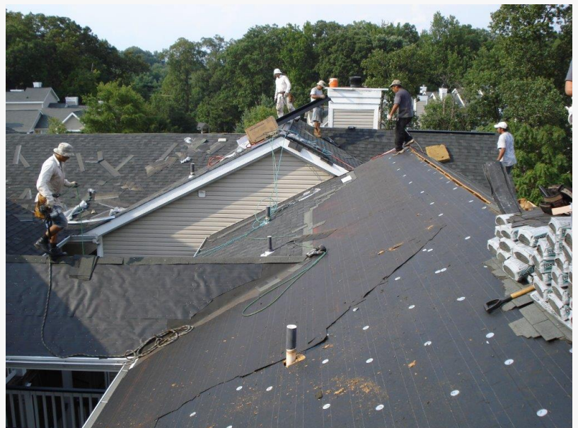
Roofing Company in Fort Lauderdale, FL