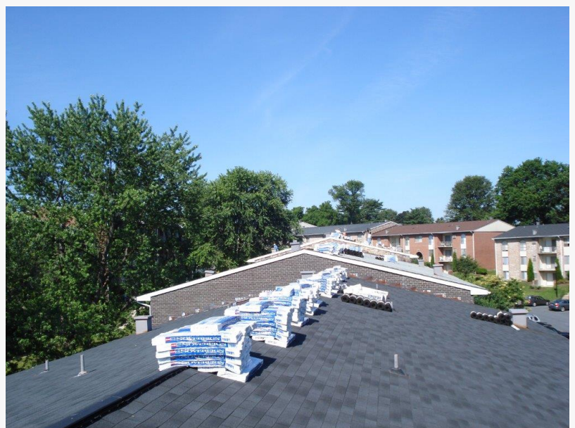
Commercial Roofing in Fort Lauderdale, FL

With South Florida's vulnerability to hurricanes and tropical storms, roofs are more than a structural necessity—they are a vital safeguard for properties, livelihoods, and communities. Dolphin Roofing is answering this call with cutting-edge materials, expert craftsmanship, and tailored solutions for residential and commercial roofing clients.