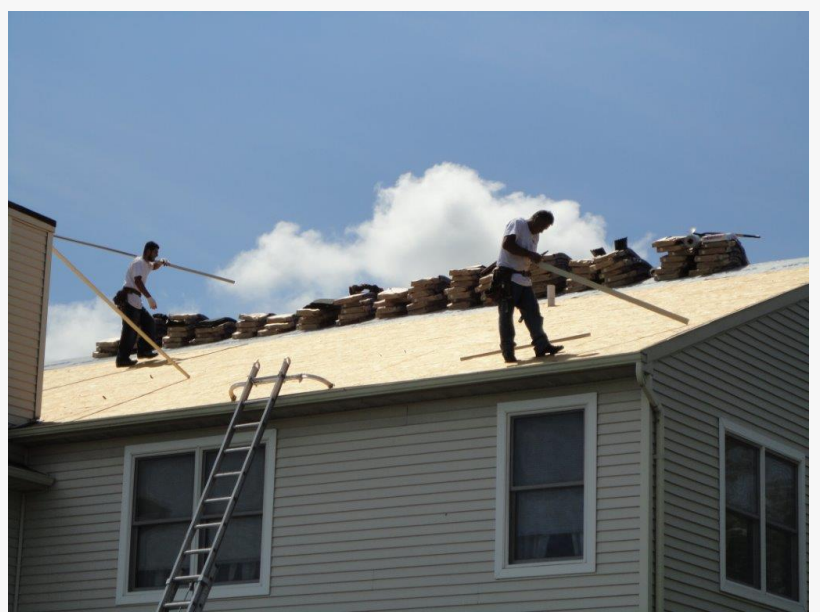
Commercial Roofing in Hollywood, FL

Cost-Effective Maintenance Plans: Proactive maintenance extends the life of commercial roofs,