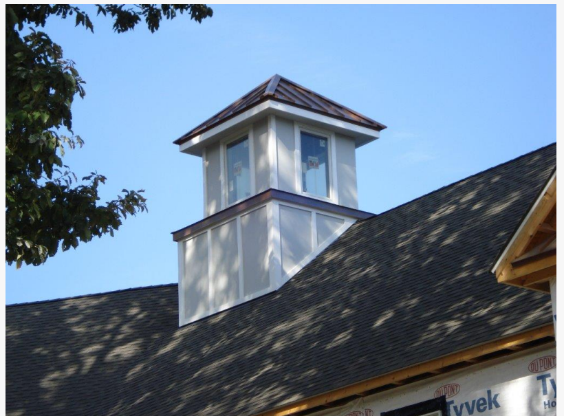
Roofing Company in Hollywood, FL