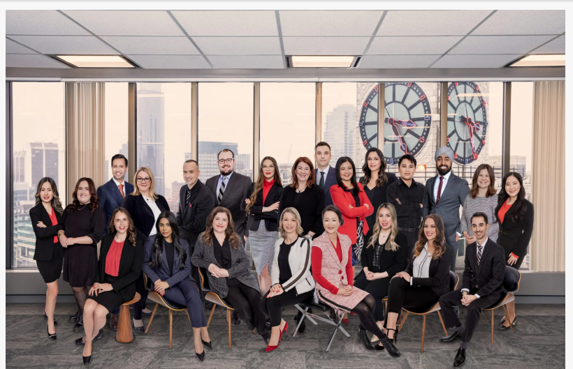
ONYX LAW TEAM

/EINPresswire.com/ -- Onyx Law Group, a trusted Vancouver-based family and estate law firm, is excited to announce the expansion of its services to better meet the needs of individuals and families throughout British Columbia. Known for their personal approach and deep expertise in Family Law and estate matters, the firm provides clear, tailored legal solutions during life's most significant transitions.