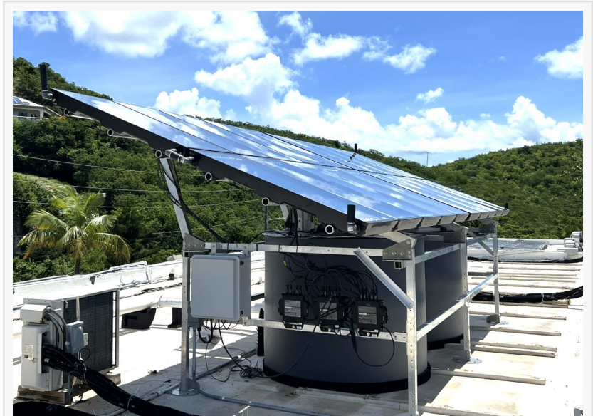
A PowerPanel GEN20 Integrated System installed on the rooftop of a resort in the U.S. Virgin Islands, using solar energy to provide all the hot water the resort needs at a fraction of the cost of using utility power. The company's new facility in Michiga

"In addition, we will be working with local organizations such as LEAP ( Lansing Economic Area Partnership ) and MichiganWorks! to create over 150 quality, full-time new jobs – with 40% of those being filled by workers from designated disadvantaged communities" added Schultz.