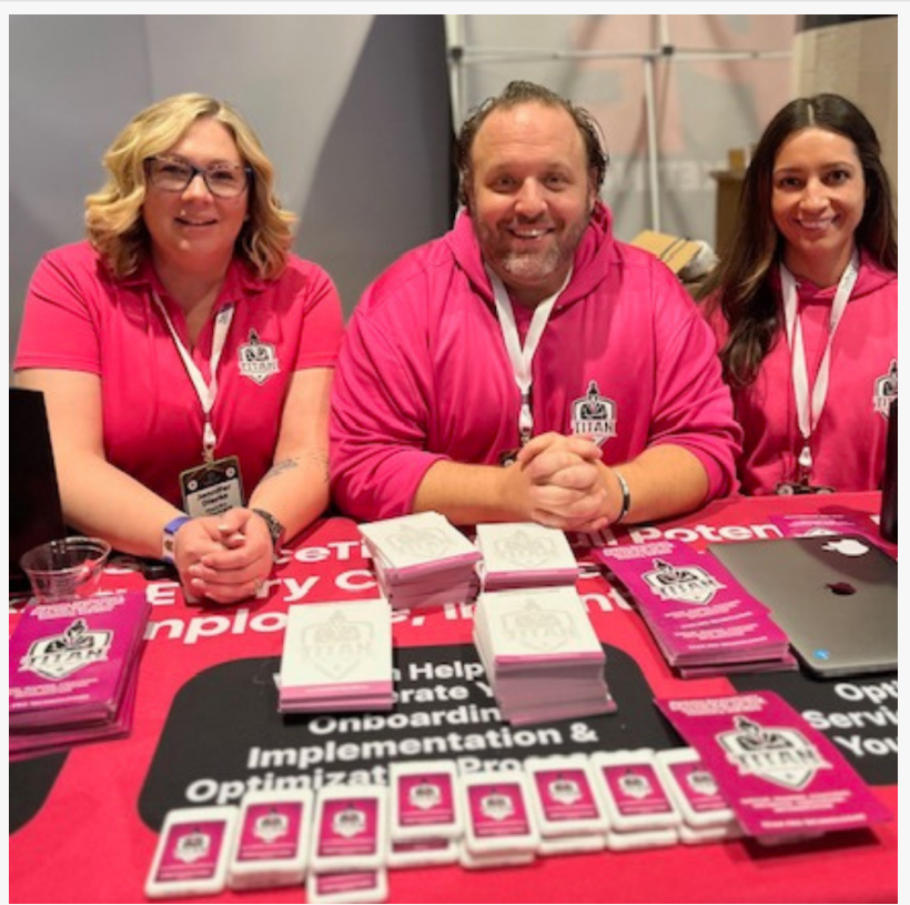
Titan Pro Technologies Honored as Titanium Partner with ServiceTitan

Titan Pro Technologies specializes in helping businesses maximize the potential of their ServiceTitan platforms. Through expert guidance and customized strategies, the company optimizes over 100 aspects of the software, including pricebook management, marketing campaigns, dynamic pricing, reporting, and operational efficiency. By transforming ServiceTitan from a tool into a strategic advantage, Titan Pro Technologies empowers businesses to scale, increase profitability, and deliver superior customer experiences.