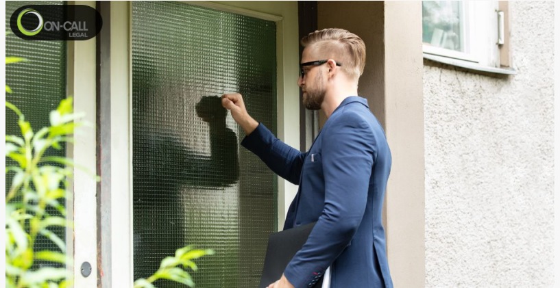
On Call Subpoena Services