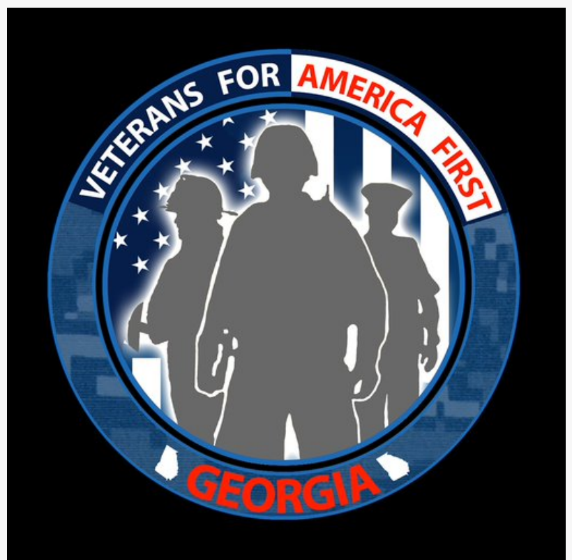
Georgia Veterans for America First - VFAF GA State Chapter

VFAF Veterans for America First AKA Veterans for Trump was invited as part of the grass roots campaign to Mar-A-Lago in November 2022 for Donald Trump's announcement of his run for 47th president. The former president shared the endorsement of VFAF for his bid on the Truth