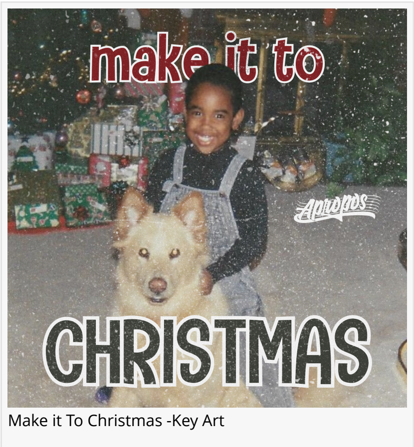
Make it To Christmas -Key Art

The Make it to Christmas music video is available to watch now on the official APROPOS Instagram page, or the official APROPOS YouTube channel.