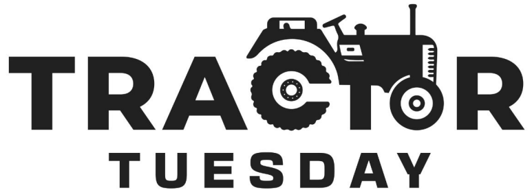
Tractor Tuesday logo