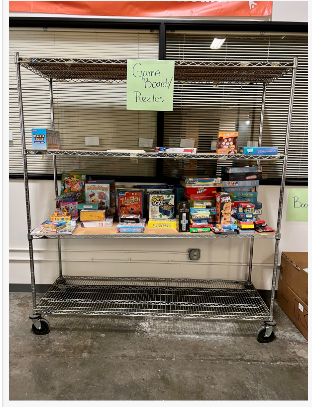
We are short on toys, and we need your help today!