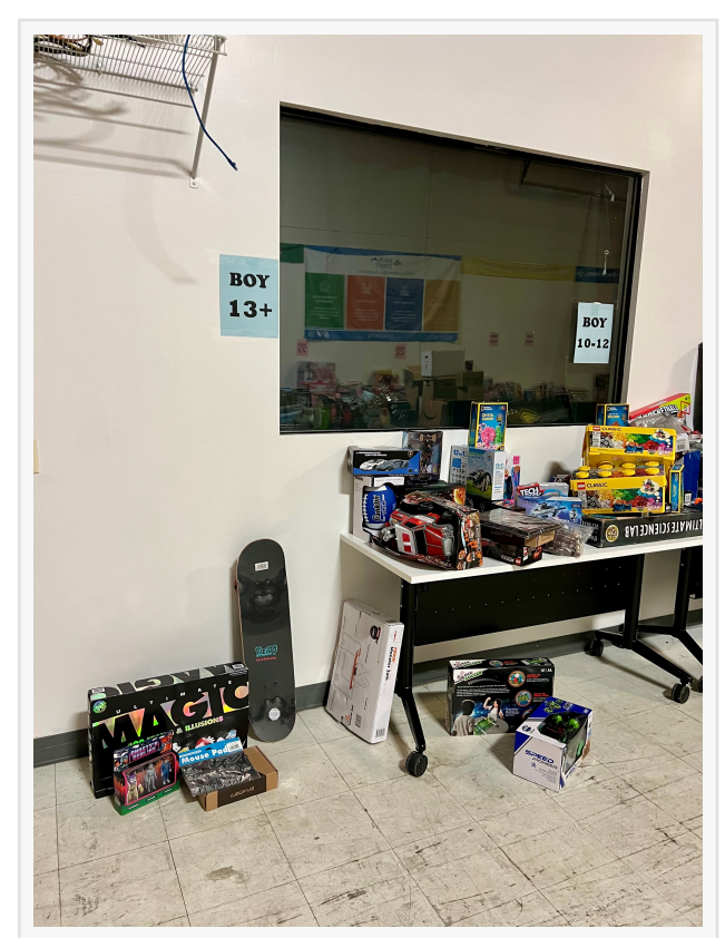
Davis Street Community Center Inc.

Davis Street Community Center Inc. 3081 Teagarden St. San Leandro, CA 94577 510-347-4620 www.davisstreet.org