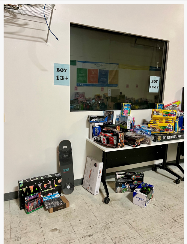
Davis Street Community Center Inc.