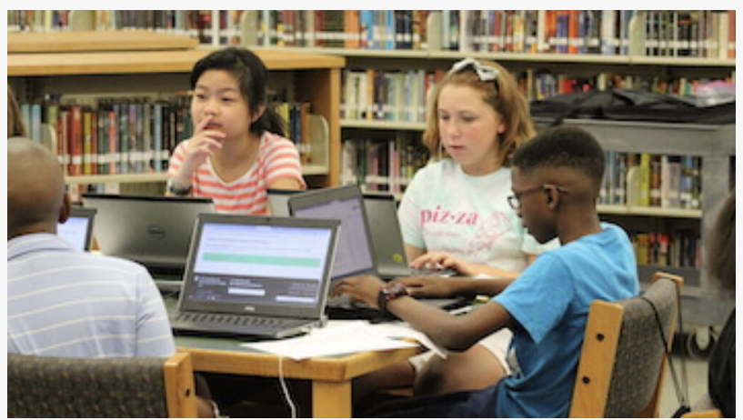
6th Grader Who is Brown Bound!