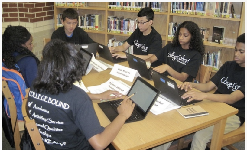
College Planning Session