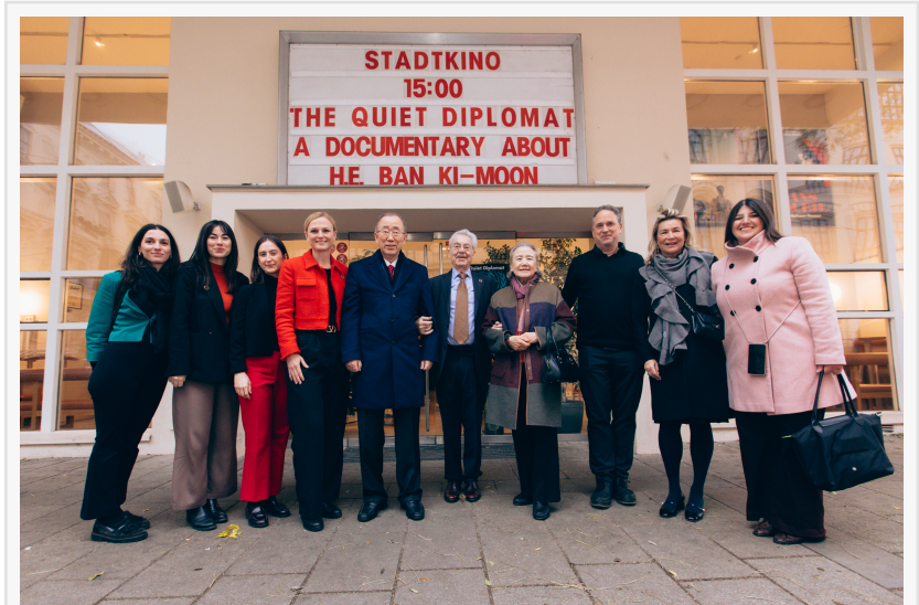
Co-chair Ban Ki-moon at the film premiere of "The Quiet Diplomat" in Vienna, Austria.