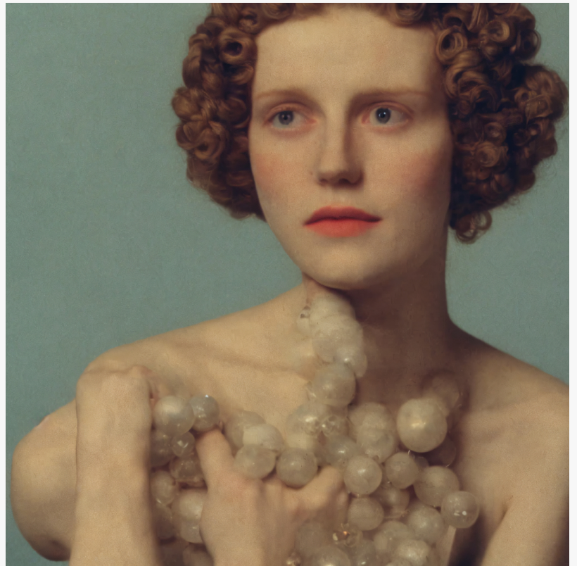
Francesco D'Isa, Error#0, 2024