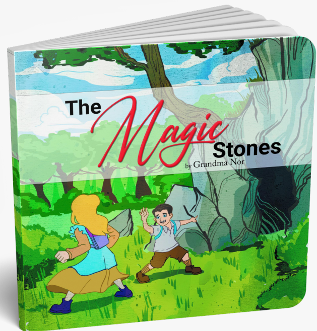
The Magic Stones