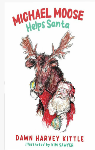
Michael Moose Helps Santa