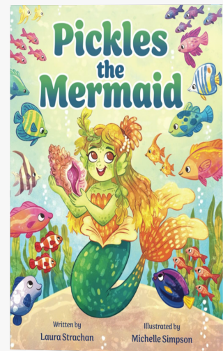
Pickles the Mermaid