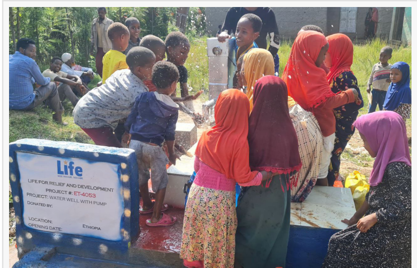
Life for Relief and Development - Ethiopia- Water Wells 2024

Many nonprofits are working hard to solve this issue by building water wells in communities that lack access to clean water. Life for Relief and Development (LIFE) is one of the nonprofit organizations that has participated in providing clean water worldwide since 2011 to 4 countries. In 2023 and 2024, LIFE dug 209 water wells in 19 countries.