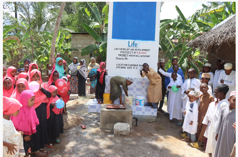
Life for Relief and Development - Tanzania - Water Wells 2024

“Before Life for Relief and Development (LIFE) began digging water wells, our school struggled to