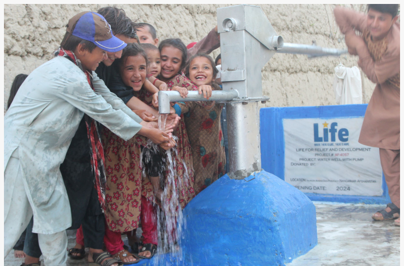
Life for Relief and Development - Afghanistan - Water Wells 2024

LIFE looks forward to providing clean water in many more communities in 2025 and would like to thank all their donors for their support in making this happen!