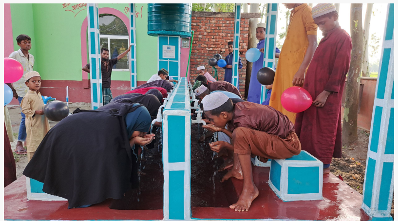
Life for Relief and Development - Bangladesh - Water Wells 2024