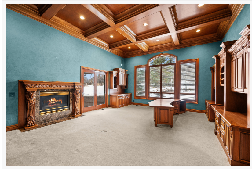
Timeless elegance can be found in the design features throughout

Inside the main residence, every detail has been meticulously curated to offer luxurious living. The grand entryway leads to a living room with dual fireplaces, a mini bar, and a sweeping staircase that ascends to the owner's suite—a private retreat with a two-story closet, dual vanities, and a luxurious spa-like bathroom with dual showers and a grand bathtub. The main level also includes an office with built-in cabinetry and a fireplace, a spacious formal dining room, and a great room complete with a gourmet kitchen. The kitchen is equipped with