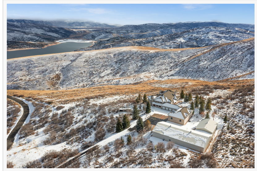
1501 Oak Haven Lane, Wanship, Near Park City, Utah

Automotive enthusiasts will appreciate the 14-car garage, a true paradise for storing and displaying vehicles. The garage, with its custom cabinetry, built-