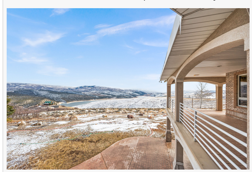
21-acre mountain estate minutes from world-class skiing

in workbenches, and ample storage space, is just the beginning of what this property has to offer, including the ability to accommodate up to 60 vehicles. The property also features a separate car barn, complete with a 50's style diner to allow for additional entertaining.