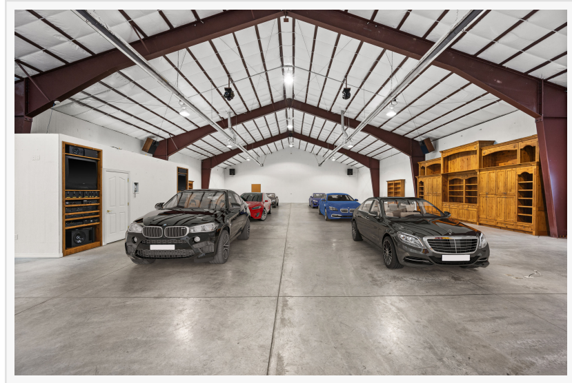
Extraordinary parking for up to 60 vehicles

The lower level of the home offers stunning lake views and a wealth of recreational amenities. A guest suite, theater room, game room, and a ball pit for children provide endless entertainment options. The space also includes a kitchen, exercise room, and a basketball court, making it an ideal space for both relaxation and active pursuits. Outside, expansive patios and