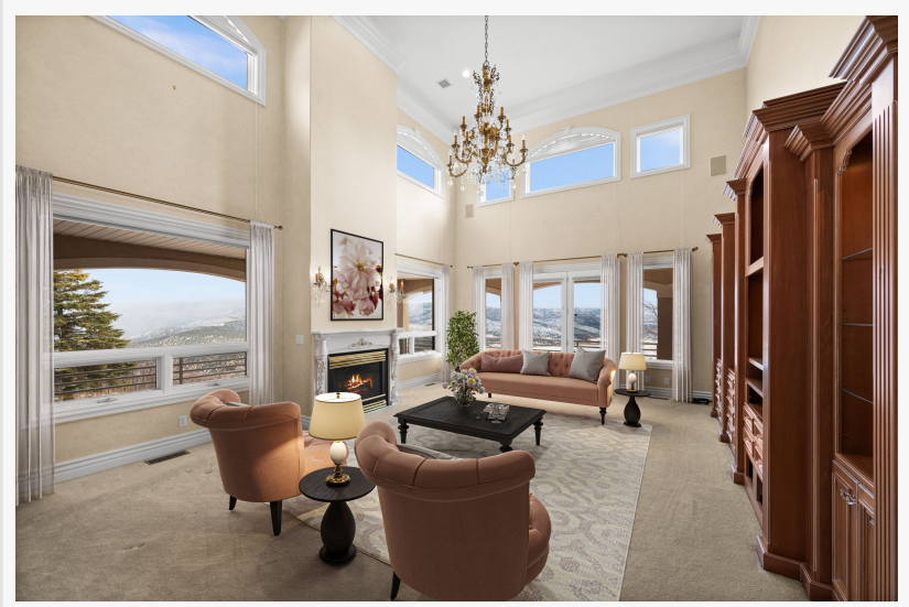
Built for entertaining, the home features four kitchens, a theater, basketball court, and and multiple entertainment venues

updated cafe-style ovens, a breakfast bar, and dining nook, with easy access to an evening patio, while a large butler's pantry and a second refrigerator add convenience.