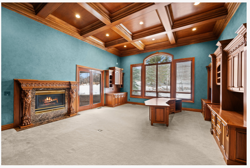
Timeless elegance can be found in the design features throughout

Inside the main residence, every detail has been meticulously curated to offer luxurious living. The grand entryway leads to a living room with dual fireplaces, a mini bar, and a sweeping staircase that ascends to the owner's suite—a private retreat with a twostory closet, dual vanities, and a luxurious spa-like bathroom with dual showers and a grand bathtub. The main level also includes an office with built-in cabinetry and a fireplace, a spacious formal dining room, and a great room complete with a gourmet kitchen. The kitchen is equipped with