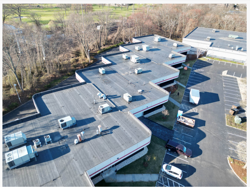
550 West Avenue, Stamford CT

EINPresswire.com/ -- The V20 Group has successfully completed the sale of 550 West Avenue in Stamford, Connecticut, to an affiliate of Jornik Manufacturing. The property, a 55,000 square foot shallow bay industrial building, is 100% leased at the time of sale to four tenants, reflecting the successful leasing and stabilization of the asset under The V20 Group's ownership.