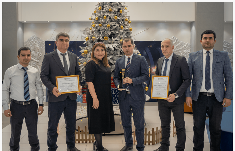
Spitamen Bank Management Team

The Global Brand Frontier Awards, conducted annually by Boston Brand Research & Media, celebrate outstanding achievements across industries worldwide. This year's award recognizes Spitamen Bank's unwavering dedication to adopting cutting-edge treasury technologies, implementing robust financial risk strategies, and fostering economic progress. By aligning its practices with international standards, the Bank continues to deliver unparalleled value to its clients and stakeholders.