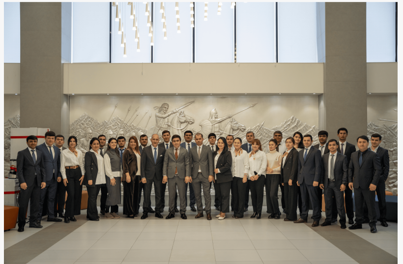
The Team at Spitamen Bank