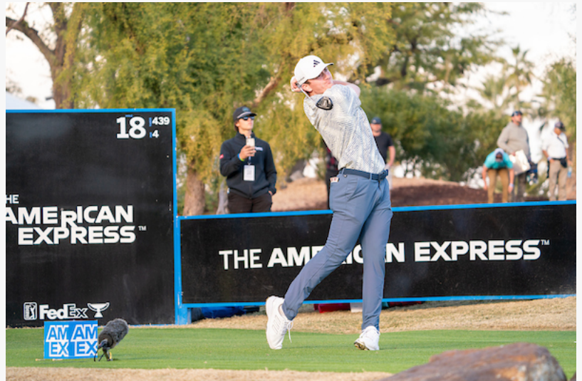
Nick Dunlap, The American Express® Defending Champion