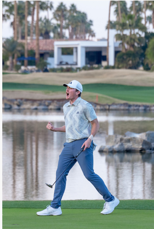
Nick Dunlap, 2024 PGA TOUR Rookie of the Year

□ First player in TOUR history to win as an amateur and a professional in the same season