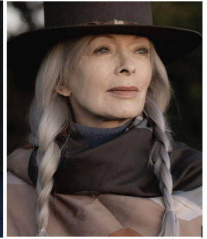
Award-winning Cast includes Joe Cortese and Frances Fisher in Death Of A Salesman