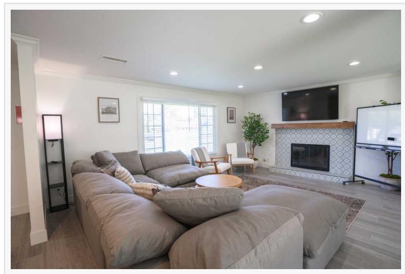
Harmony Junctions unveils new facilities for Couples Rehab Programs in Orange County

Choosing to start recovery during the holidays allows clients to enter the New Year with renewed purpose and hope. Harmony Junction Recovery provides the tools, resources, and