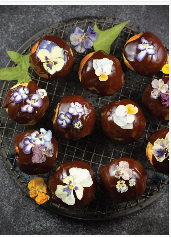
Chocolate Truffle Æbleskiver with Chocolate Glaze

ANDREA BURNETT Andrea Burnett PR +1 650-207-0917 email us here Visit us on social media: Facebook X LinkedIn Instagram