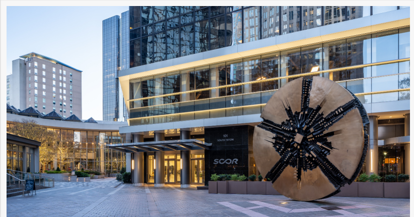
One South in Charlotte, NC

In 2019, Dole made a major move when they relocated their main U.S. office and core functions to Uptown Charlotte from Westlake Village, Calif. Their Uptown offices house senior-level executives as well as various critical departments including legal, human resources, marketing and sales. Dole will relocate from another Uptown office building to One South in summer 2025. The move will allow the company to continue its growth and contribution to Uptown's economic development while providing its current and future employees with a modern, fully amenitized workplace experience that facilitates greater collaboration in a vibrant and innovative environment. Brian Brtalik, Mike Dempsey and Taylor Clayton of