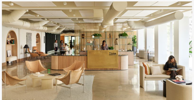
THREE, the amenity space on the third floor of One South in Charlotte, NC