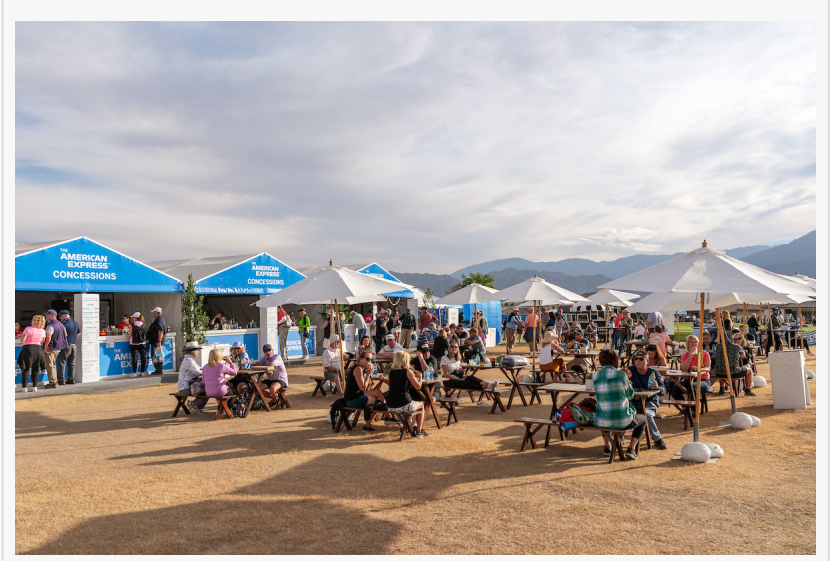
Premium food and beverage options