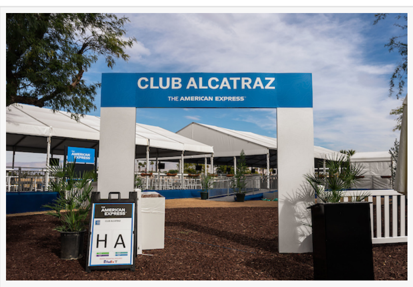
Club "Alcatraz" a fan favorite venue

LA QUINTA, CA, UNITED STATES, December 20, 2024 / EINPresswire.com/ -- The American Express® PGA TOUR Golf Tournament promises an elevated fan experience with exciting activations, premium food and beverage options, and unique entertainment offerings designed to complement the thrill of world-class golf. The American Express® returns January 16th-19th, 2025 at PGA WEST's