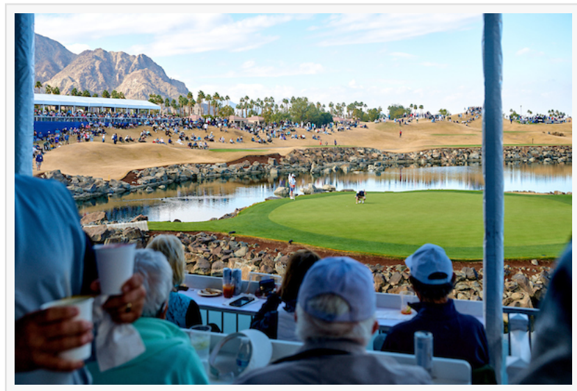
Prime views of golfers

Bushmills Irish Whiskey Lounge: Set between the 9th green and 10th tee, this lounge invites fans to enjoy products from the world's oldest whiskey distillery while cheering on players starting, finishing, or making the turn in their rounds.