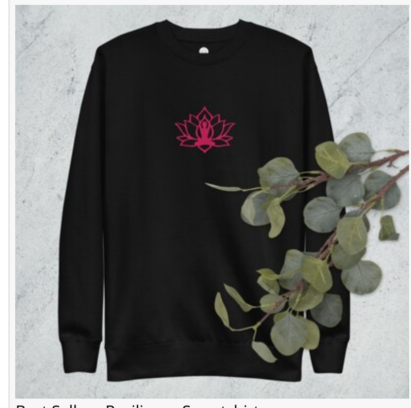
Best Seller - Resilience Sweatshirt

As the brand continues to grow, You Are GLAM hopes to inspire women everywhere to embrace their unique beauty, stay grounded in gratitude, and move through life with purpose and grace.