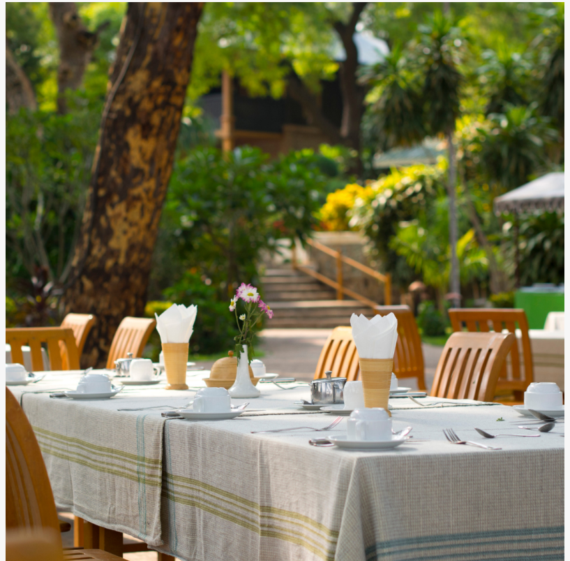
San Diego Restaurant Supply Store

Meeting the growing demand for reliable and efficient solutions, RestaurantSupply.com provides an extensive catalog of over 500,000 products tailored to the essentials of local restaurants, cafes, and catering businesses. From commercial cooking equipment to sanitary supplies, the platform offers high-quality tools designed to streamline operations and enhance dining experiences.