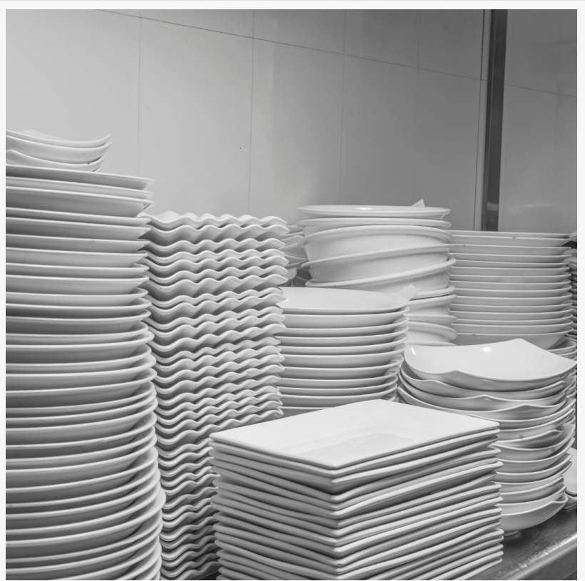
Los Angeles Restaurant Supply Stores