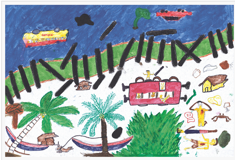
Galle, Sri Lanka. Southbound Coastal Train #50 carrying over 1,500 paid passengers and an unknown number of unpaid passengers.

The drawings by the children survivors offer eyewitness reports and provides a SOFT remembrance. This emotive choice contrasts with the HARD images of documentary photography of ruined buildings and beaches. The children draw the trauma of the Tsunami wave: victims bleeding, people crying and shouting, and terror at the scale of the disaster. No camera could capture that or it would be certain death. Images from the Children Speak: