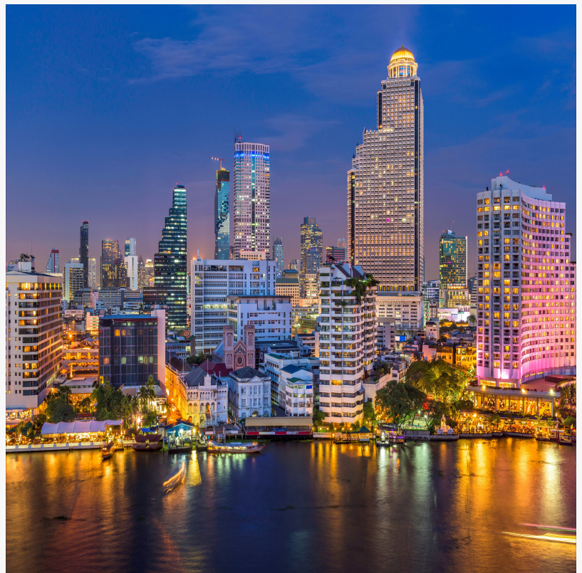
See Thailand Like Never Before