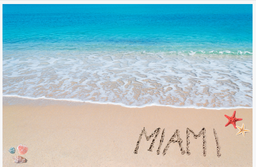
Miami, The Best Beaches In The World

Every tour is an opportunity to support local communities and contribute to the well-being of rescued elephants. Proceeds from these experiences go directly toward maintaining the sanctuary and expanding its rescue efforts.