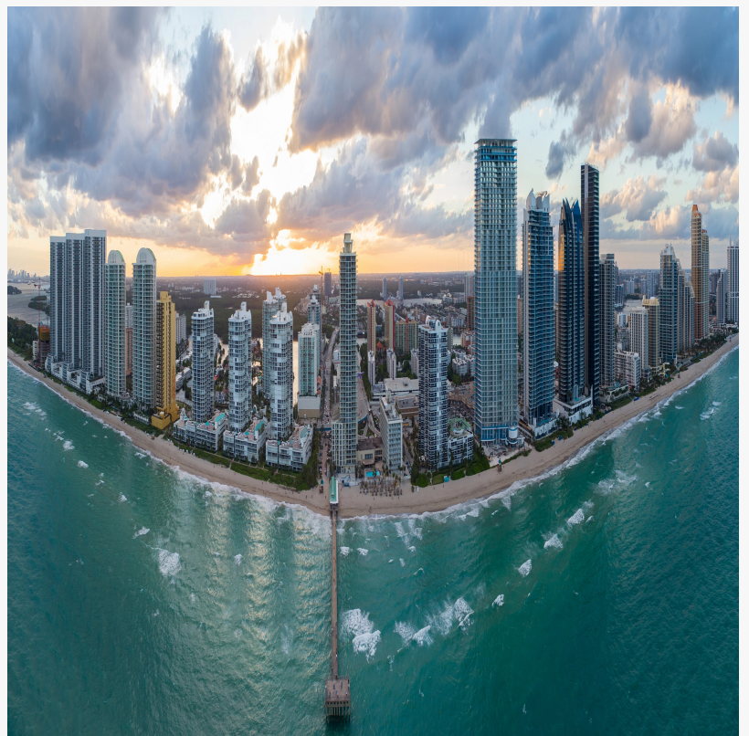
Miami Water and City View