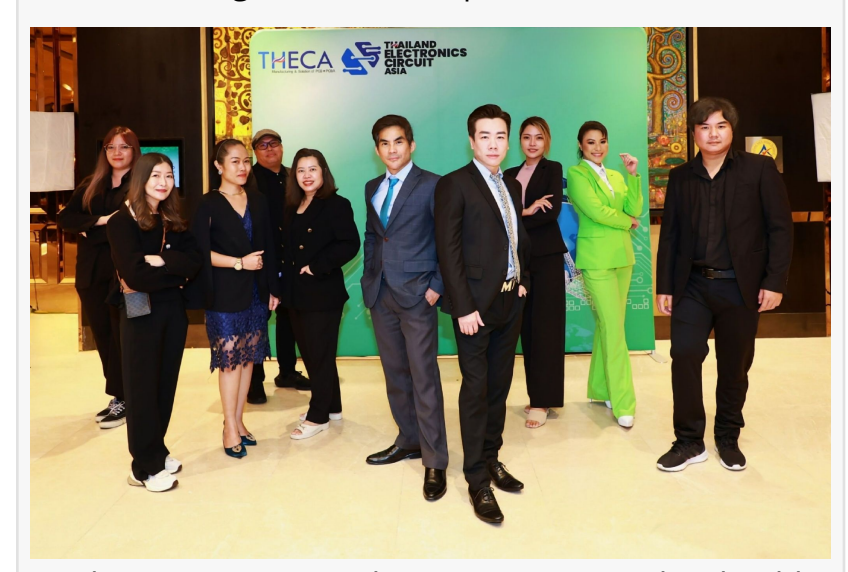
Market-Comms Co., Ltd. (MCOMMS), No.1 local public relations firm

The Thailand Electronics Circuit Asia 2025 (THECA 2025) endeavors to establish Thailand as a global center for Printed Circuit Board (PCB), Printed Circuit Board Assembly (PCBA), and Electronic Manufacturing Service (EMS) production