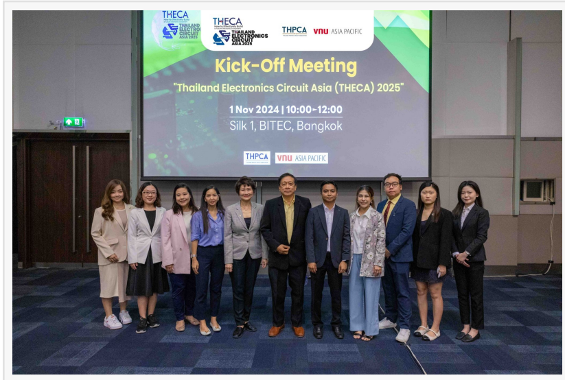
VNU Asia Pacific, the designated show manager for the event

The Thailand Electronics Circuit Asia 2025 (THECA 2025) endeavors to establish Thailand as a global center for Printed Circuit Board (PCB), Printed Circuit Board Assembly (PCBA), and Electronic Manufacturing Service (EMS) production. Under the theme "How to Effectively Build a Future Electronics Ecosystem," the event underscores the critical importance of strengthening local supply chains, fostering investment opportunities, and