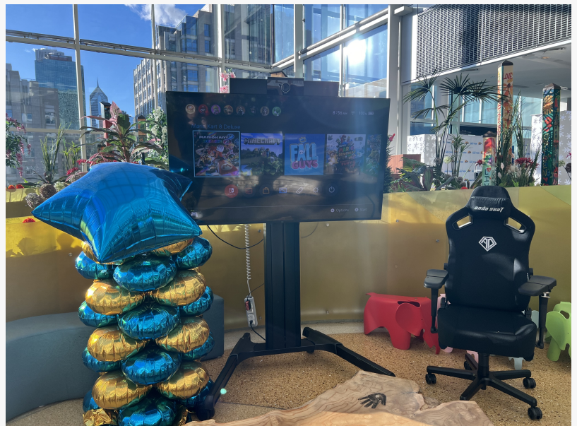
AndaSeat Empowers ALL LURIE