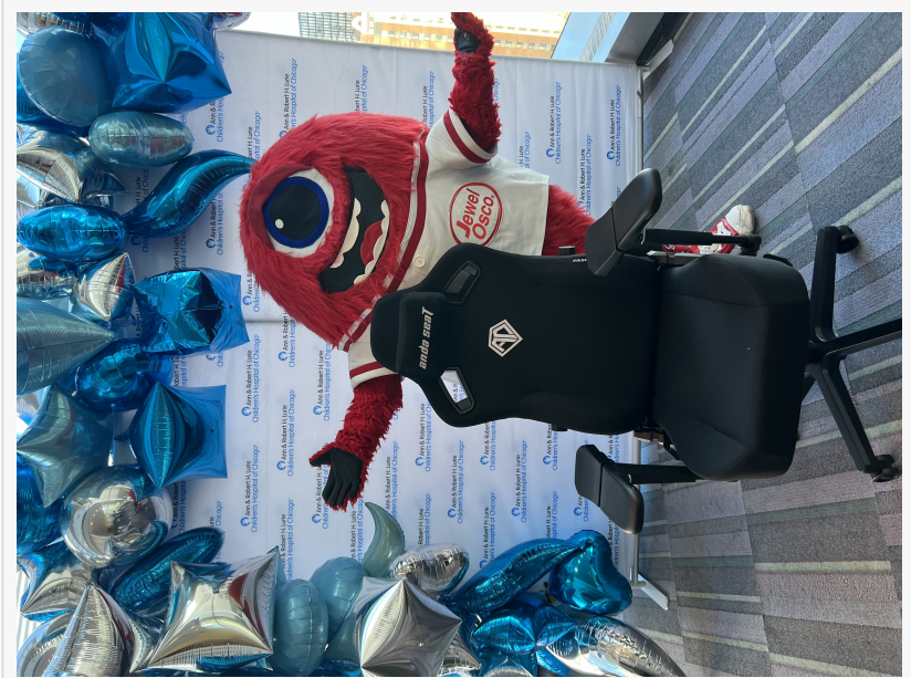
AndaSeat Empowers ALL

The hospital's gaming area has become a sanctuary of smiles and laughter as children discover the comfort of professional gaming chairs. Young patients of various ages have shown renewed enthusiasm for their daily gaming sessions, with many eagerly anticipating their time in the gaming space. The professional-grade chairs have created an environment where children can fully immerse themselves in their favorite games, finding moments of joy during