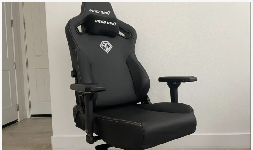
Kaiser 3 Pro Esport Review