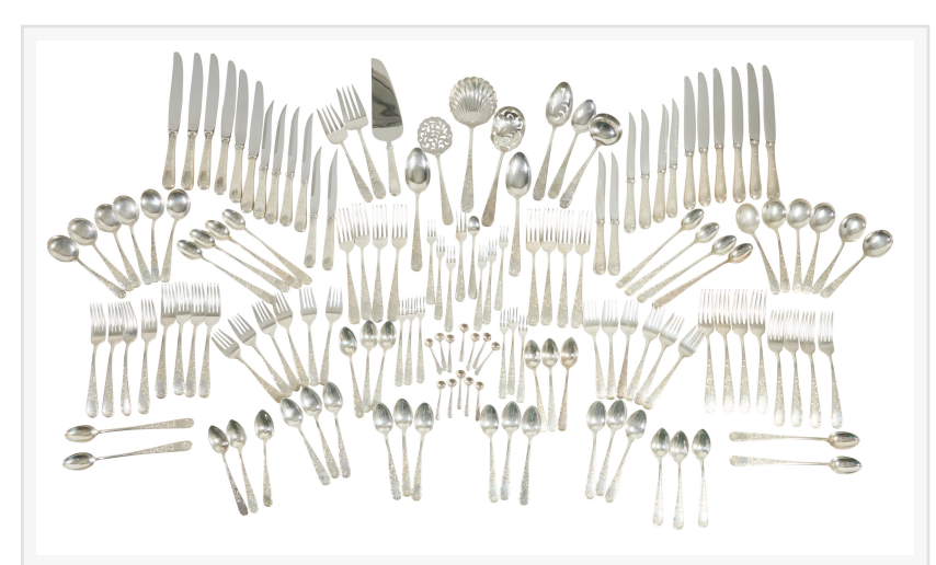
Silver offerings will include this 20th century 145piece sterling flatware set by Kirk & Sons (est. $4,000-$8,000).

app, as well as LiveAuctioneers.com and Invaluable.com. Phone and absentee bids will also be taken. In-gallery previews will be held beginning Wednesday, January 8th, through Thursday, January 16th, excluding weekend days, from 10 am to 5 pm Central time. No appointment is necessary. The Crescent City gallery is located at 1330 St. Charles Avenue in New Orleans, La.