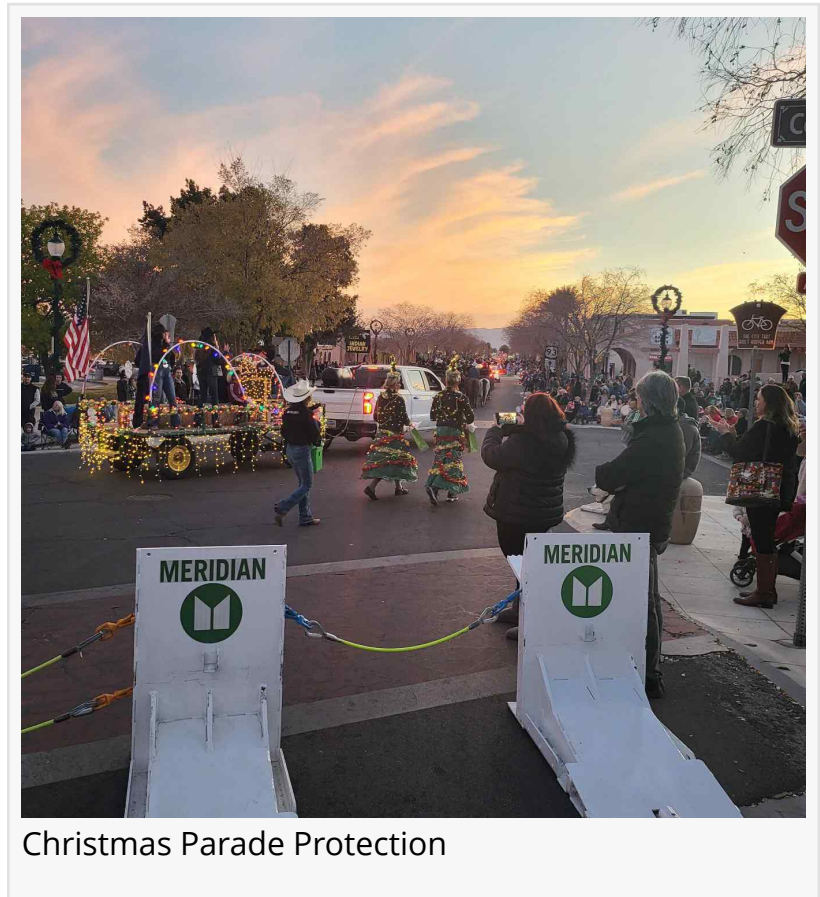
Christmas Parade Protection

PASADENA, CA, UNITED STATES, December 24, 2024 /EINPresswire.com/ -- Tragedy has already struck this holiday season with the deadly Christmas Market crash in Germany. Protecting crowds has become a critical feature of event planning and this holiday season Meridian Rapid Defense Group has been working alongside city officials, helping ensure holiday and sporting events across the U.S. have been made a whole lot safer. Several parades, holiday fairs and sporting events are being secured using Meridian's Archer 1200 Barrier systems and gates.