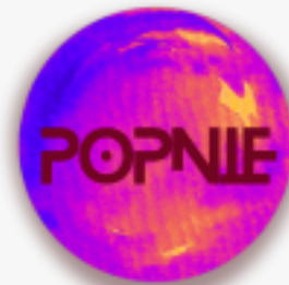
Popnie AI Language Assistant Logo