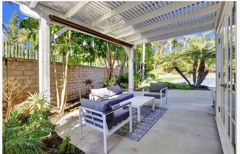
Still Water Wellness Offers Top Facilities for Rehab

This press release can be viewed online at: https://www.einpresswire.com/article/771673892