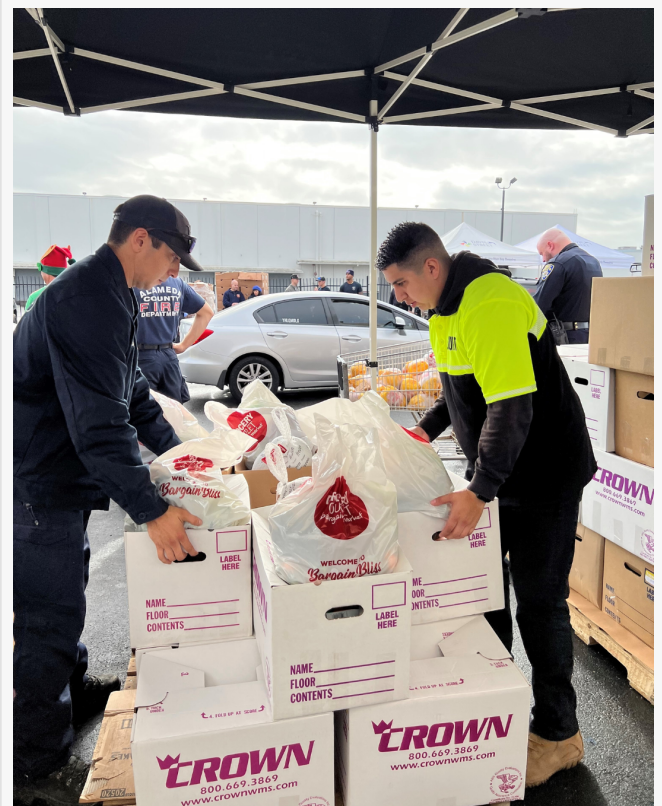
Members of Alameda County Fire Department and CME Security Services help distribute holiday baskets.