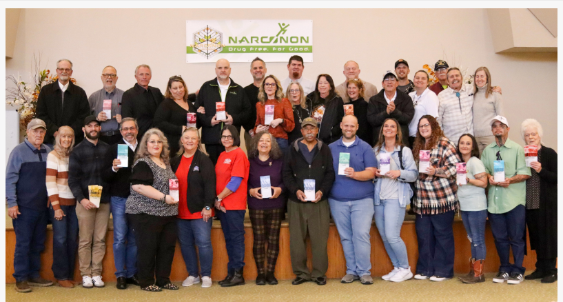
Narconon Graduate Event Attendees

EINPresswire.com/ -- Learning that the Centers for Disease Control(CDC) found that drug-and alcohol-related deaths spike in December and January, a coalition of concerned residents and Narconon program graduates have mobilized to save lives with effective drug prevention. They launched their holiday season initiative December 7 at a gathering at the Narconon Arrowhead Drug & Alcohol Rehabilitation Center in Southeast Oklahoma.