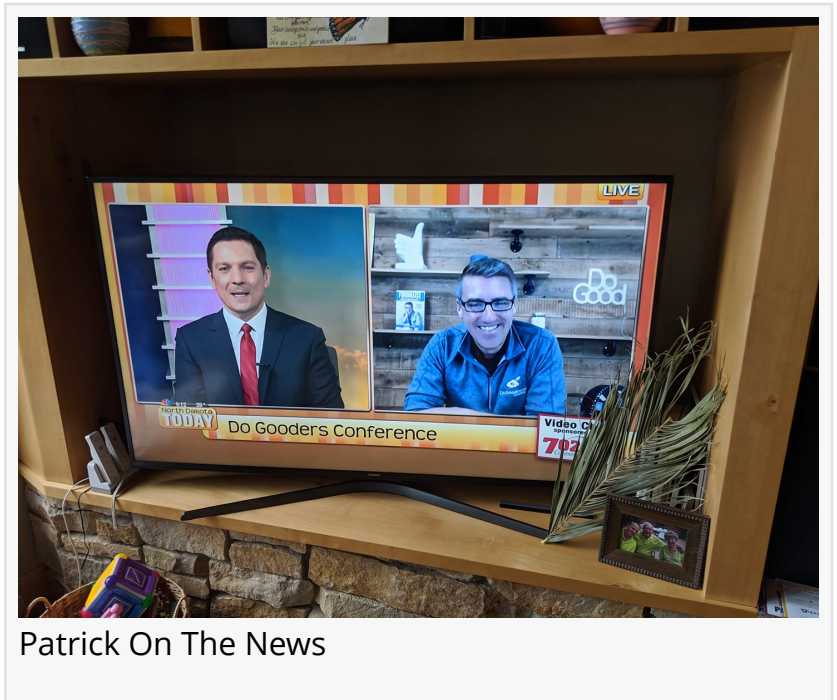
Patrick On The News

This press release can be viewed online at: https://www.einpresswire.com/article/771856832