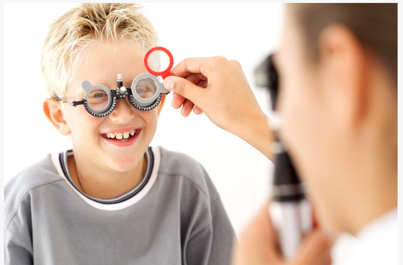
Pediatric Eye Exam-