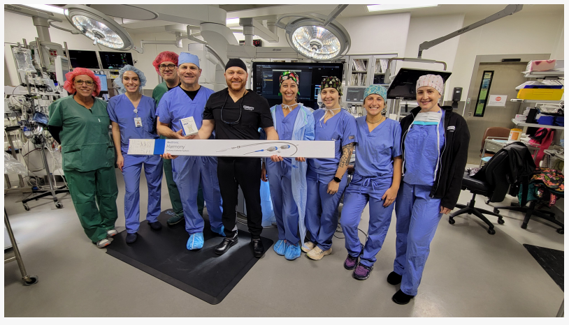
HonorHealth Harmony Team

This press release can be viewed online at: https://www.einpresswire.com/article/771996229