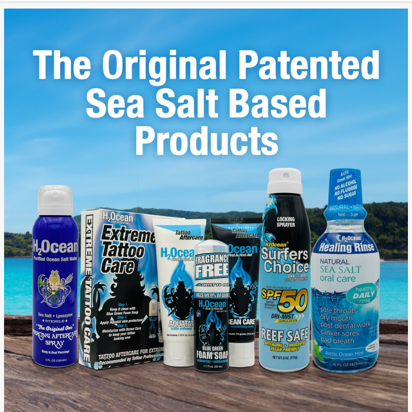
H2Ocean Original Sea Salt Based All Natural Products

Cancer Support Initiatives: H2Ocean's commitment to supporting cancer survivors is evident in its expansion of the Chemo Mouth website. This resource is tailored to assist individuals struggling with the oral side effects of chemotherapy and radiation therapy. It provides scientific evidence to understand healing properties of natural and gentle sea salt-based solutions to manage the oral side effects, including dry mouth, oral mucositis, metallic taste, ulcers, dysphagia, and more.